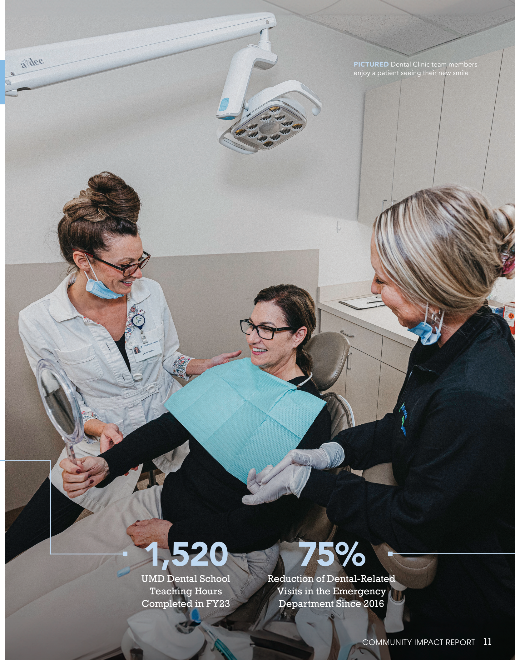
PICTURED Dental Clinic team members enjoy a patient seeing their new smile